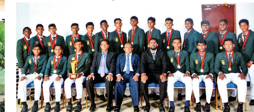
Cricket team with the Principal, coach and teacher-in-charge