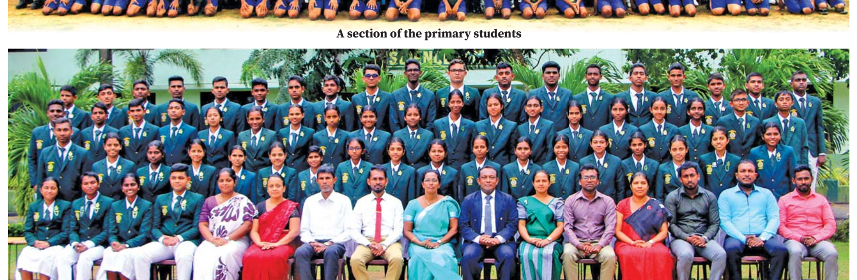
Prefects with the Principal and teachers-in-charge

The school's commitment to nurturing socially responsible citizens is evident through its impressive track record of excellent results and achievements in vari-